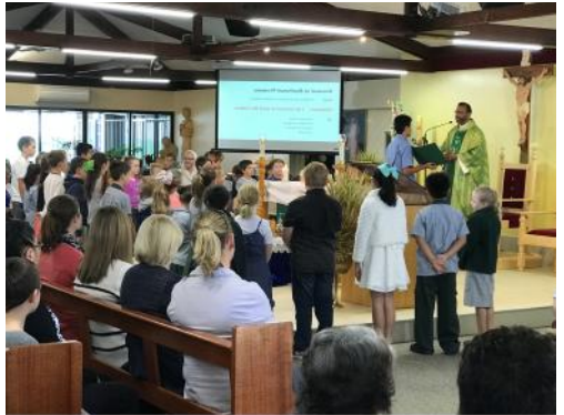
Children renewing their baptismal promises as preparing for their Confirmation.