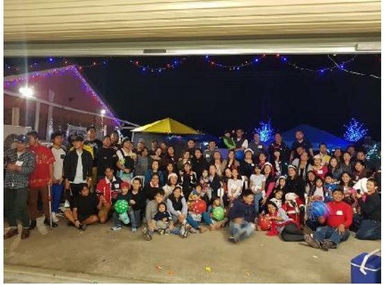
CFCA having fun at Christmas in July function

The Christian Life program, that runs for 7-8 weeks, is held every year in one chosen parish to help new couples, youths and single individuals to understand their faith and be part of the CFCA community if they choose to.