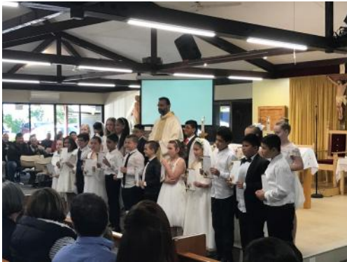
Congratulations to our young people after receiving their first Communion