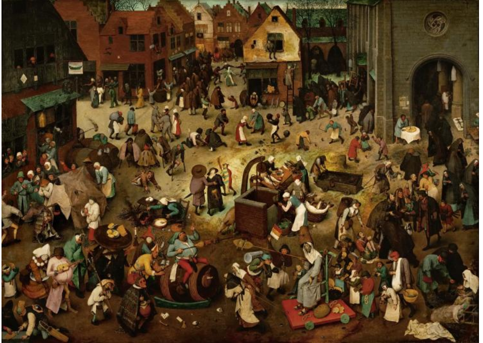
The Fight Between Carnival and Lent is a painting by Pieter Bruegel the Elder from 1559, showing the contrast between two sides of life, as can be seen by the inn on the left—for enjoyment, and the church on the right—for religious observance.

In some countries the eating of pancakes has become a custom as it allows for the eggs and butter to be used up before the beginning of Lent. In other countries this is a Carnival day, and the last day of "fat eating" or "gorging" before the fasting of Lent.