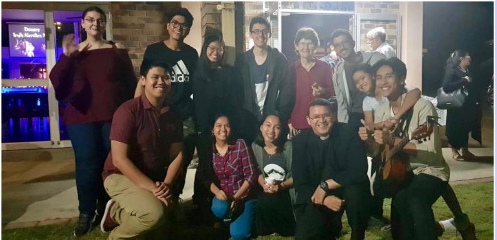
St Patrick's Youth Ministry (SPYM) in a group photo with St Matthew's Youth Ministry after Adoration at St Bernadine's Regents Park. SPYM stood for the music at this event.