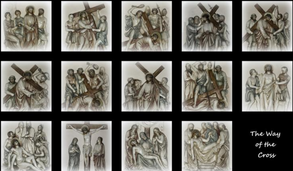
The Way of the Cross

The Stations of the Cross are a 14-step Catholic devotion that commemorates Jesus Christ's last day on Earth as a man.