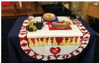
Come – Everything is Ready

The Celebration was well attended with around 80 people joining in the service. The Bible readings and the stories from the women of Slovenia were beautifully presented by the representatives from each of the churches in the Beenleigh area. Namely, St George's Anglican Church, St Patrick's Catholic, Uniting Church, Bethesda Lutheran, Salvation Army and Baptist Churches. The hymns were sung with gusto by the Anglican choir.