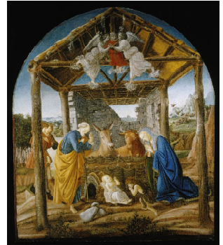
Nativity of Jesus, c. 1473-1475, by Botticelli