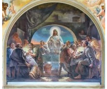
Jesus Christ Last Supper https://i.pinimg.com/