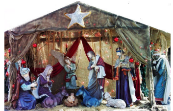
Nativity set in Bethlehem town square