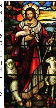
A depiction of Jesus: stained glass: Alfred Handel, photograph: Toby Hudson