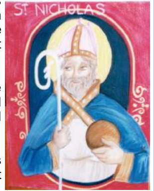
St Nicholas, St Patrick's Parish, Beenleigh

Nicholas died on December 6, 343 in Myra. This day, St. Nicholas' feast day, is celebrated throughout the world to keep alive the stories of his goodness and generosity, often by bringing treats and gifts to the children.