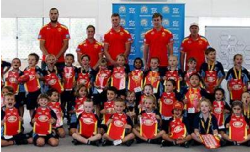
Gold Coast Suns coach and players joined Year 2 students at Mother Teresa School to launch the Little Legends program

YEAR 2 students at Mother Teresa School, Ormeau, put some hard-hitting questions to players from the Gold Coast Suns at the launch of the AFL club's Little Legends program.