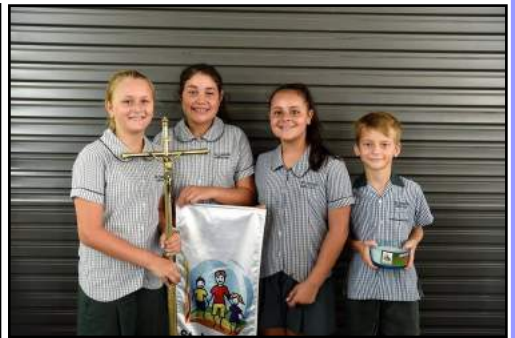
Leadership Mass in St Joseph's school Hall