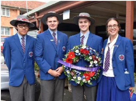
School captains assembling outside the church and preparing to lay a wreath.

Trinity College is a Catholic co-educational secondary College administered by Brisbane Catholic Education, with a current enrolment of 840 students in Years 7-12. At Trinity College we have established a school that provides multiple pathways for our students across a wide range of curriculum, sporting and cultural areas. The College draws its students mainly from the regions of Beenleigh, Beaudesert, Loganholme, Ormeau, Jacobs Well, Jimboomba, Logan Village, Mt Warren Park, Tamborine, Woodlands, Windaroo, and surrounding areas. Enrolments are now accepted for 2018 and 2019.