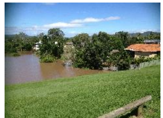
Mt Warren Blvd