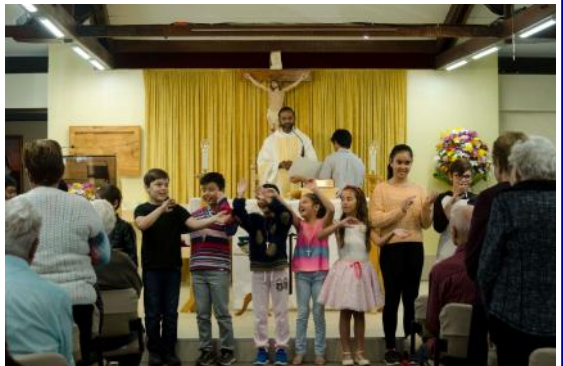
Mother's Day performance by Children's Liturgy group

CLOW is never simply a verbal experience, it is a liturgical celebration and all the principles of good liturgy still apply. The children do what the rest of the community is doing at this point of the Mass. The use of symbols, gestures, movement and singing heightens the children's experience of God. They listen to the scriptures proclaimed and applied to contemporary life and respond in various ways. It is an experience of prayer, of dialogue with God.