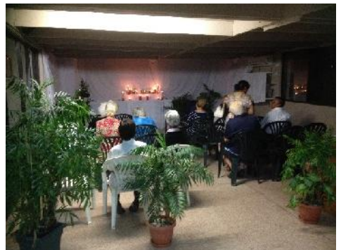
Adoration in the transformed Truelson room