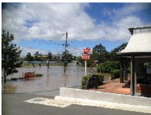
Coles Beenleigh carpark after cyclone Debbie