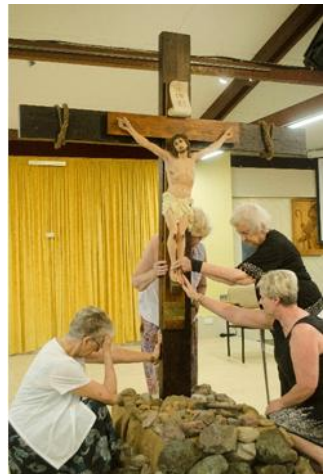
Veneration of the Cross