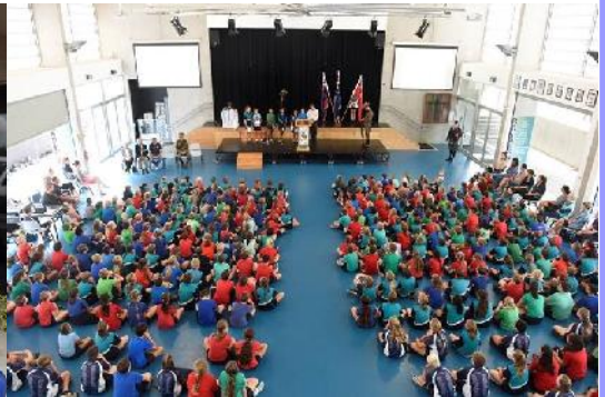
ANZAC ceremony at St Joseph's