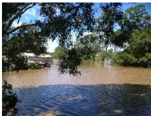
Mt Warren Golf Club